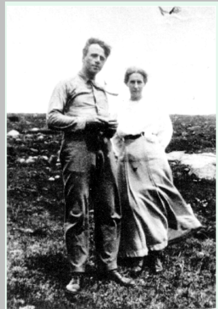
Robert and Elinor Frost at Plymouth, New Hampshire, 1911