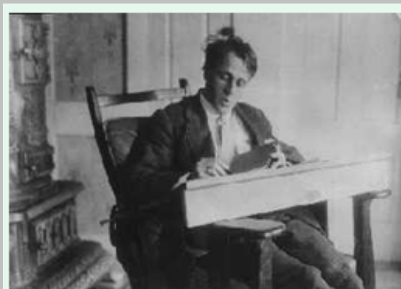
Frost in Franconia, N. H. 1915

Photo Courtesy of Jones Library, Amherst